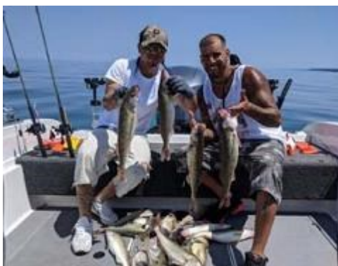
Dutch Fork Charters