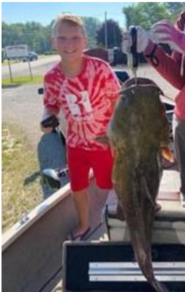
39.79 lb. Flathead Catfish

Laurie @ Duck-N-Drake; filed 7/13: The last few days some of my customers have figured out how to limit out on walleyes by trolling Shad Raps in 16 to 17 feet of water right on the bottom in snag-infested areas south of the Causeway. Hanging up a lot, but catching legal fish. Timing is a big factor. The bite is very early in the morning when the sun is low on horizon. Also heard of some nice crappies coming in 11 to 12 feet of water by the Causeway; they were using Bonehead plastics.