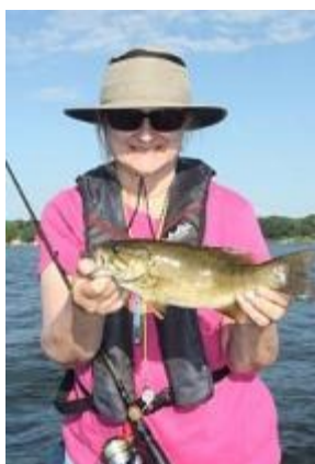
Ned Rig smallie