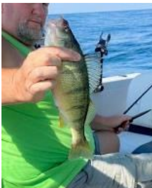
Chad sez perch out there