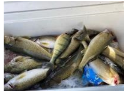
Chad Prihode & friends catch

Chad Prihode ; filed 8/15: I had a decent day. Starting east of Walnut Creek trolling towards Trout Run in 62 feet of water. Water temperature was 75 degrees. Fish were holding at about 50 feet. I pulled green spoons on Magnum Dipseys on 0 setting at 70 feet back. Also, green shallow divers on regular Dipseys on #3 setting at 130 to 140 feet back. Plus, purple Reef Runners with 5 colors of lead on inline planer boards. We trolled 2.1 miles per hour. Landed 16 walleyes and one nice perch. (See photos)