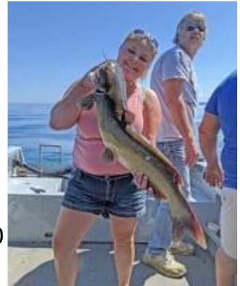
Someday Isle Tackle photo