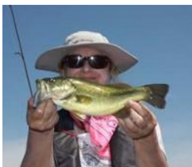
Galida's Grubz largemouth