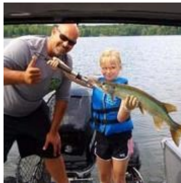
angler unknown