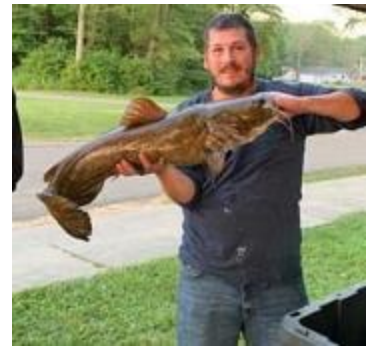
21.28 lb Flathead

Laurie @ Duck-N-Drake; filed 8/17: Some walleye action with trolled crankbaits in 15 to 20 feet; top baits have been Rapala Shad Rap and Berkley Flicker Shad – we have both in stock. Perch are biting pretty good on the South End. Live minnows in 18 to 20 feet deep is a good starting point; great reports from around the water treatment plant on the Ohio side. But August is becoming a big catfish month. We just held the catfish tournament this past weekend with 31 teams participating. Winning team had the 3-cat tourney limit going 37.56 pounds. Second place had big fish of the event with a 21.28-pound flathead catfish – they were fishing from shore! (See photo of big flathead.)