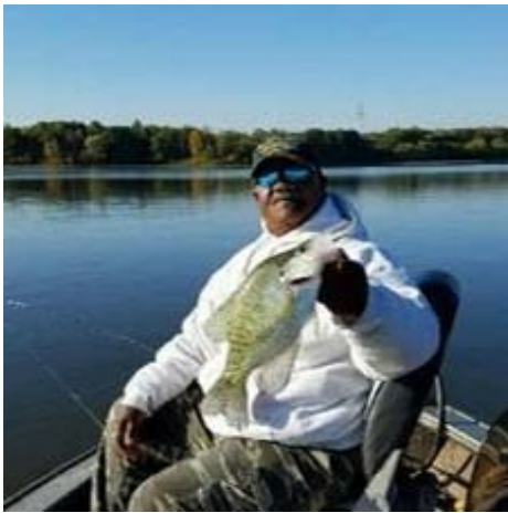
Shenango Crappie