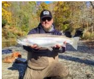
Erie steelhead