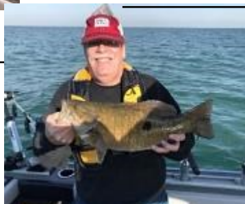
Erie SMB