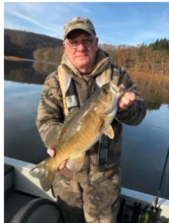
Allegheny SMB—Gene photo