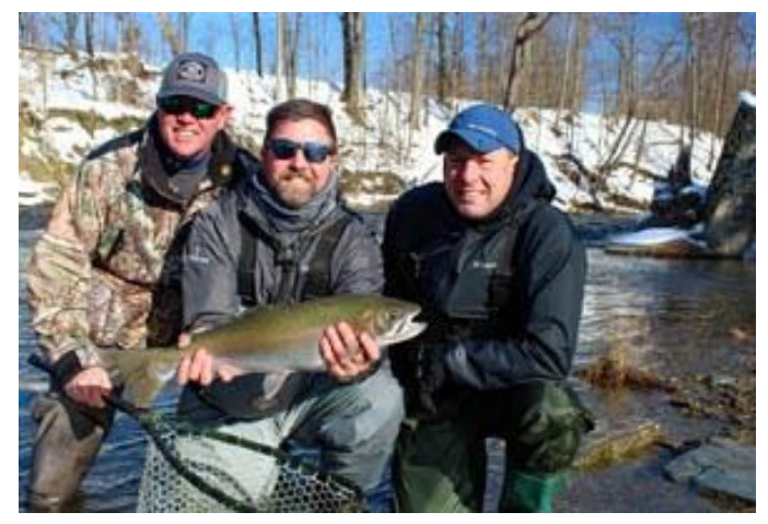
For something different this winter, consider booking a trip with a guide this winter, such as Wildwood Outfitters.

Fishing with Darl Black Information Service