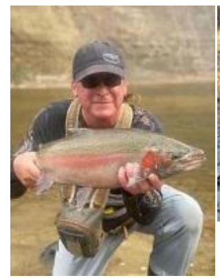
Photo array from Tudor Hook-N-Nook and Solitude Steelhead Guide Service