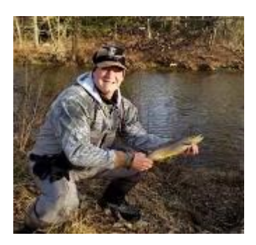
Sugar Creek Brown

Angler Al @ Buttermilk Hill; filed 12/11: With recent uptick in warmer weather this past week, I had an opportunity to get out on Sugar Creek a couple times. Each time I caught fish, including rainbow and brown trout, and a few smallmouth bass. Drifting live shiners worked best. Caught some on pieces of nightcrawlers. When using a fly rod, griddle bug nymphs and egg patterns brought the best response. The nicest trout I caught was a gorgeous brown trout just shy of 20 inches. (See photo) I hit French Creek during last hours of light a few times. I haven't landed a walleye yet, but did have a dandy on — until it broke my line in a snag. Northern pike have been regular feeders whenever I offered large size creek baits. Lots of 20 to25 inchers and occasionally a bigger one. (See photo)