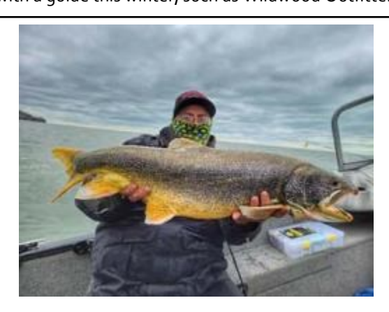
Don't forget the Lake Trout bite next year