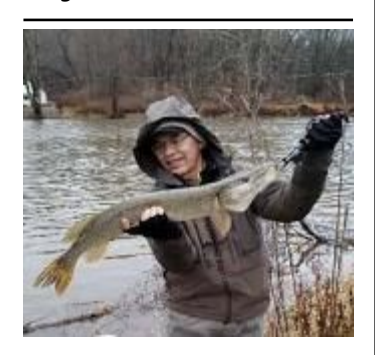
French Creek Pike