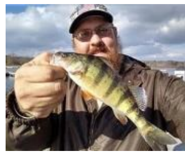
Docks at Wilhelm