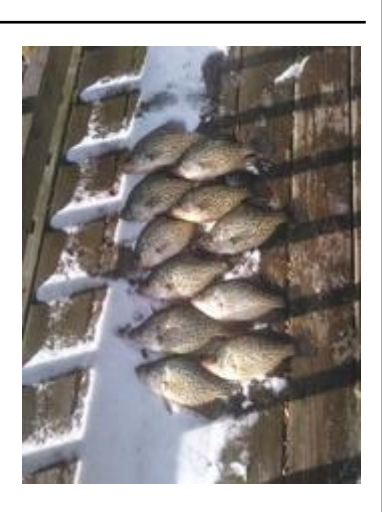
Austin's previous dock trip