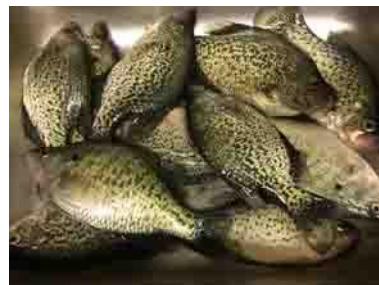
Ken's Shenango crappies

Ken Smith (Sharon); filed 4/19: I was out on Shenango one day this past week before the cold snap. I caught all my crappies in four feet of water near wood. (see photo)