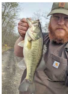
Jig bite on Wilhelm

Bo @ BC Bait Co. ; filed 4/19: I was out once this past week on Wilhelm. I did pretty good on crappies and some perch. The fish I'm catching are still up by the Sheakleyville causeway. Medium size purple Terry Bug fooled them.