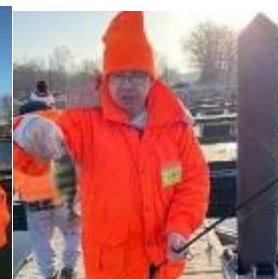
On Linesville docks