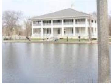
Casino on Lake Julia