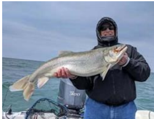
Dutch Fork Charter—Erie Lake Trout