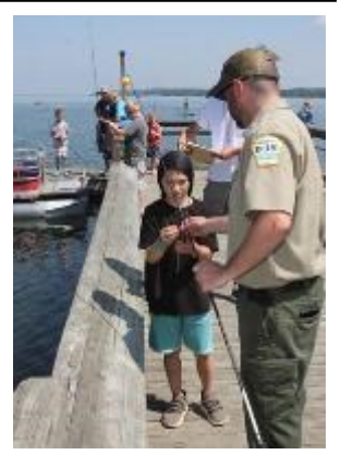
Red, White & Bluegill