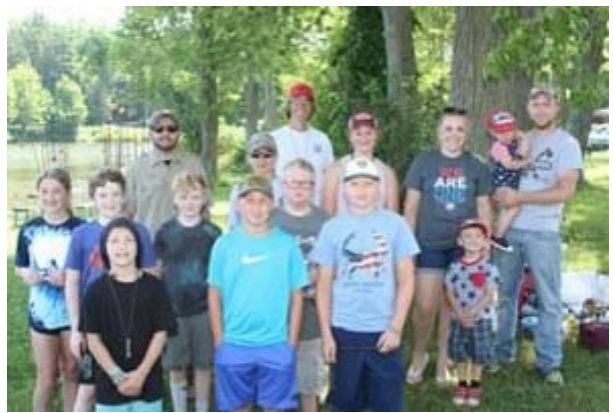
Red, White & Bluegill fishing clinic