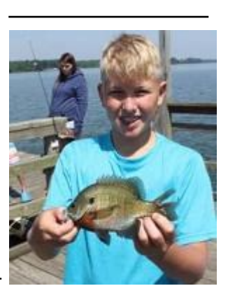
Red, White & Bluegill