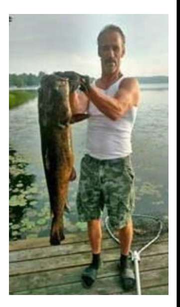
Monster of Canadohta released to be caught again