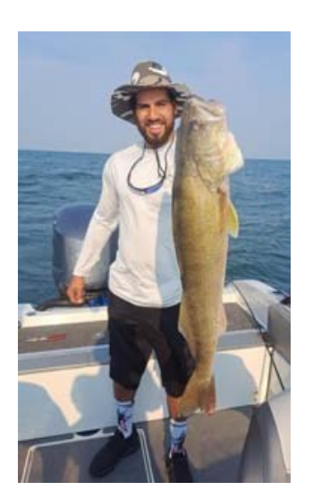
Dutch Fork Charter