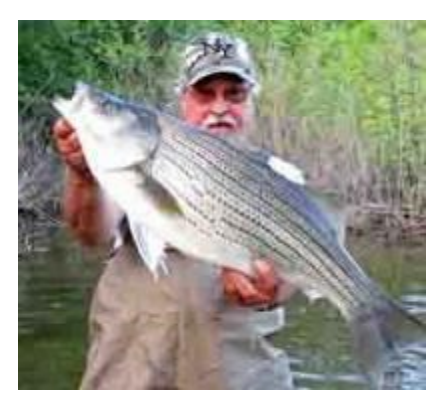
Captain Hook with river hybrid