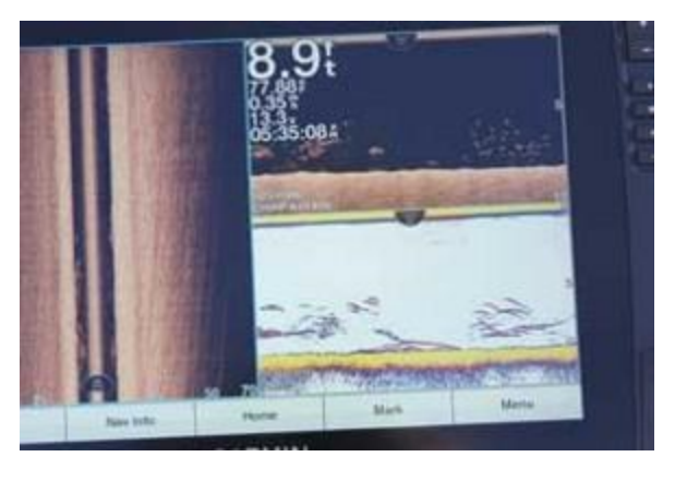
New Garmin Echomap Ultra 126sv showing the way

tronics doing it yourself? See Gus. Want to buy a new Garmin unit? Well, you'll have to wait a bit longer on direct purpose until Gus receives authorization as a dealer. But in the meantime, he can put a unit and power source in the right way. For the time being, contact Gus on Facebook. – Darl Black