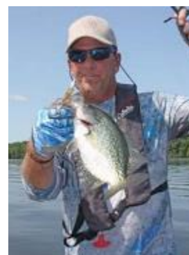
Cold front crappies