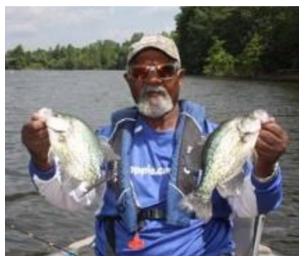
Pennsylvania's Mr. Crappie