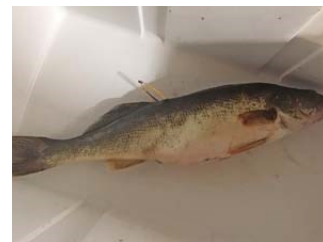
Greg's $100 tagged walleye

Wish) from the shop for luck. It paid off with a one in a million tagged fish. Congratulations to Greg and company for a nice stringer and a $100.00 walleye. Fish On!