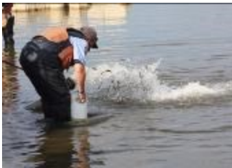
Forage siners being stocked