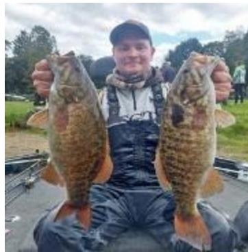
RJ with Allegheny smallies