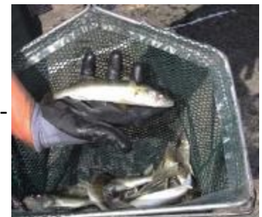
Walleye being stocked

“Smallmouth bass, yellow perch and black crappies populations seemed to withstand the drawdown with less impact,” said Ensign. “But musky and walleye would require stocking because they do not spawn naturally in the lake.” In June the PFBC stocked 20,000 walleye fingerlings plus 12- to 14-inch musky yearlings to rebuild stocks. Early in October, Ensign did another assessment survey, and determined that smallmouth bass, crappies and other panfish had reproduced. However, the walleye numbers were low. So, the Army Corps decided to work with the PFBC to do an additional stocking by purchasing walleye, musky and forage fish from a private certified Wisconsin hatchery. On October 12 with both PFBC and USCOE personnel present, the stocking took place with 325 Walleye (6-8 inches), 250 Muskellunge (10-12 inches), Golden Shiners and Fathead minnows.