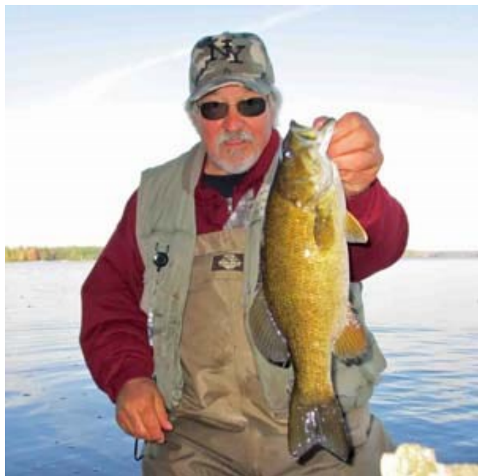
"Captain Hook" with a hefty Pymatuning Lake smallmouth bass caught from shore.