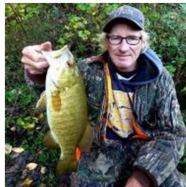
Ace with Shenango River SMB