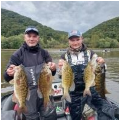
Allegheny River smallmouths