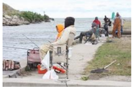
Steelhead season always starts on the Wall