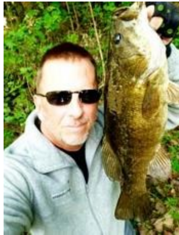
Shenango River SMB