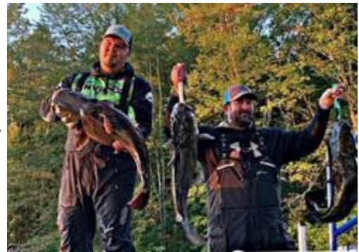
Duck-N-Drake photo of catfish winners

Laurie @ Duck-N-Drake; filed 10/3: The final catfish tournament of the season was a success; see photo of winners. Both increase in reports on walleye and big perch. Walleyes are being caught by trolling deeper water with Flicker Shads and Shad Raps. See photo of typical catch by anglers focusing on perch. Duck-n-Drake will close for the season on October 31. (See photos on right)