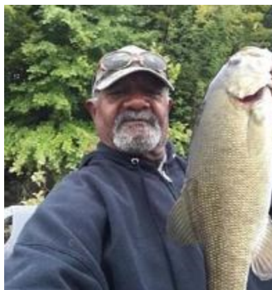
Shenango Lake SMB