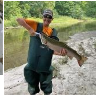
Poor Richards photo