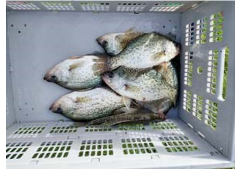
Gus Glasgow takes 6th in tourney