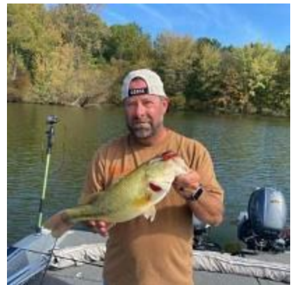
Shenango Lake LMB on Blazer Bait Crankbait