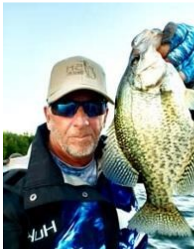
Shenango Lake crappie