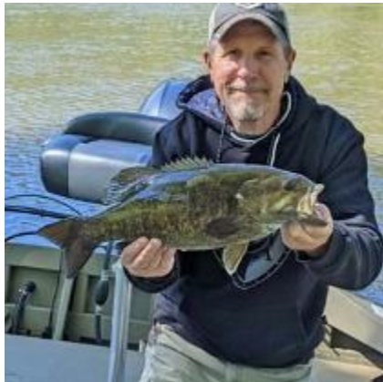
River SMB taken on Mike's Custom Tubes