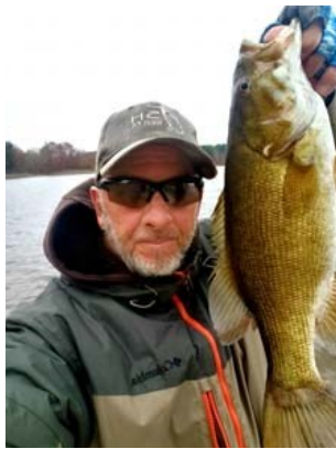
Shenango produces SMB