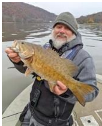
Dale's Gamma Line lands the biggest river smallmouths.