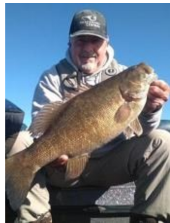
Capt. Mro guides for oversized Lake Erie SMB