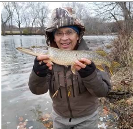
"Doc" with French Creek pike