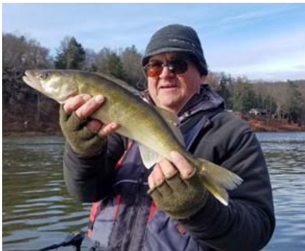
Keystone Connection Guide Service

Allegheny walleye are more active than smallmouth bass with water temp in 30s.