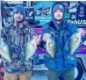
Tyle & friend at tourney