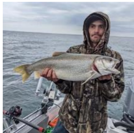
Lake Erie lake trout—NOW!