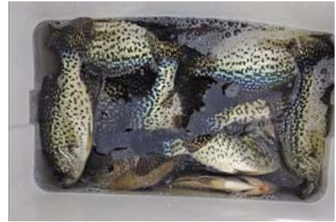
Bo's Wilhelm crappies

Bo @ Fishing with Bo ; filed 4/25: On Wednesday evening on Wilhelm, we got the crappies good. Very nice-size crappies taken from 5 feet of water along weed edges on the northern section of the lake. Orange Terry Bug on a 1/32-ounce jig produced 63 crappies in 1.5 hours. (Photo right)