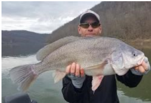
The Allegheny River is filled with mystery