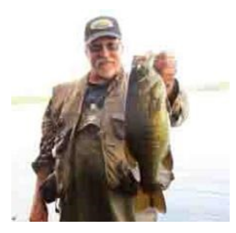
Capt. Hook; Pymatuning, 6 lb Polyflex