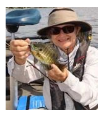
Typical CL `gill

Marilyn @ Blackwolfe Communications ; filed 8/29: Darl and I fished Conneaut Lake twice in the past couple weeks. Not targeting any species in particular, we went with the flow of whatever was biting. Several 12 to 13 inch largemouth, a few crappies, and a number of bluegills & pumpkinseed. Ironically, our Garmin sonar showed large schools of bluegills in 17 to 20 feet of water off weedy flats and mid-lake humps – but these fish were constantly moving. Catch a couple, then we would have to move around to find the school again. However, the last trip on the 29<sup>th</sup> yielded BIG pumpkinseeds from an old sunken wooden boat in 19 feet of water. By the way, on the 29<sup>th</sup>, there were massive schools of very small bluegills feeding just inches under the surface over several major weed flats – and bowfins were having a field day busting the schools. (Photos below)