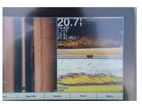
Constantly moving deep 'gill schools