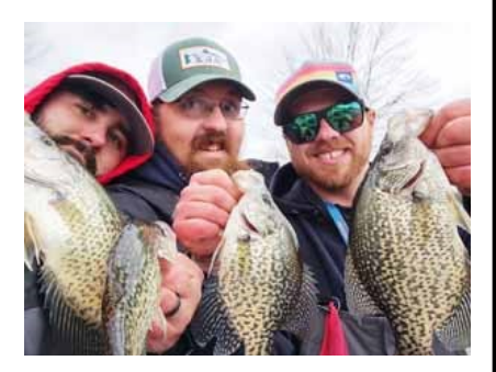
Bo and buddies on the docks

Bo @ BC Baits ; filed 11/13: I fished the docks at Jamestown twice since November 1<sup>st</sup>. We caught a good mix of panfish both times. We did the best on deeper docks near brush. Fish came on black BC Bait Co. Terry Bug on a gold 4mm tungsten jig. The biggest crappie was 14 inches. Several of the perch were over 11 inches and bluegills around 9 inches. (Picture to right)