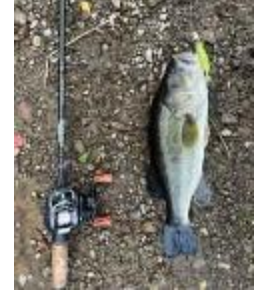
Bo @ BC Baits Co. ; filed 11/14: I fished the Wilhelm marina docks on Dock Day. Caught a bunch of small perch and bluegill. Not much luck. (See photo right)