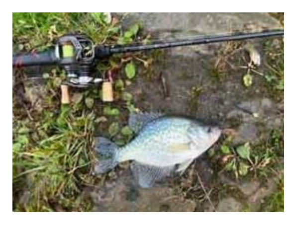
Brad Bee catching panfish with 5 lb Touch.