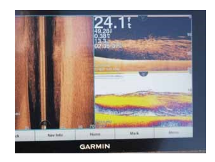
Nov 11 massive baitfish school