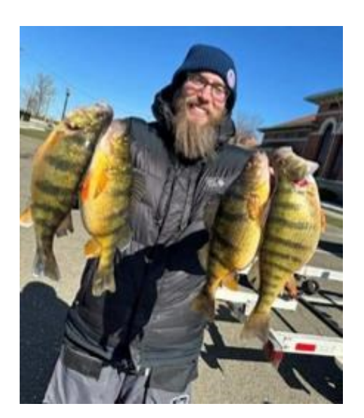
Perch fishing in PIB produced many incredible size yellow perch.