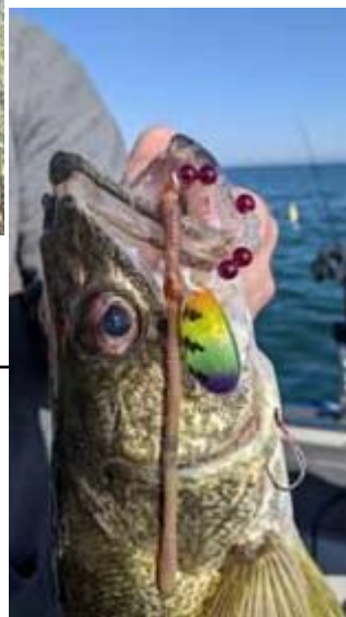
Walleye bite full throttle on Lake Erie