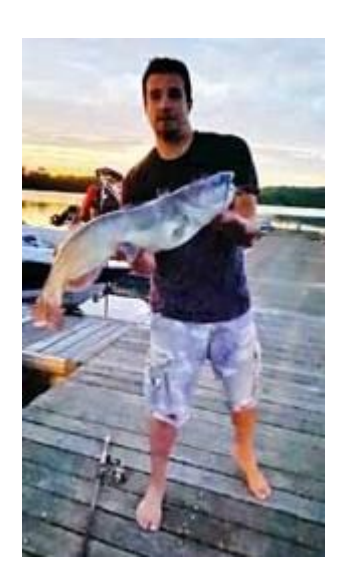
Shenango Lake Channel Catfish (Capt. Hook photo