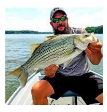
Shenango Hybrid Striped Bass