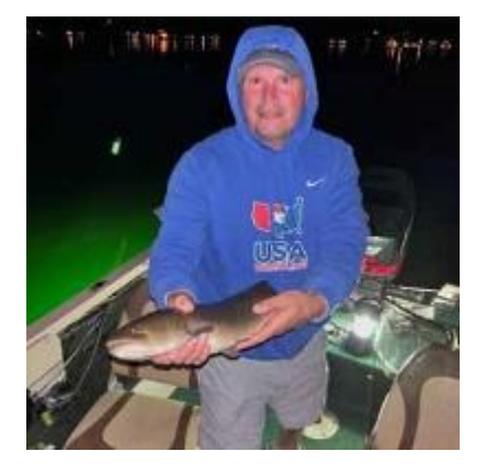
Conneaut Lake Bowfin