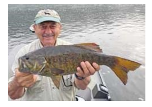
Allegheny Smallmouth