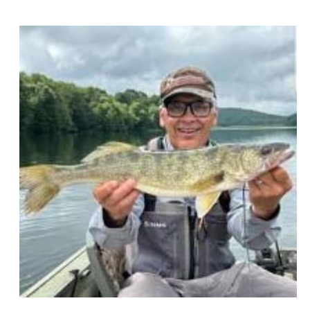
Justus Lake Walleye