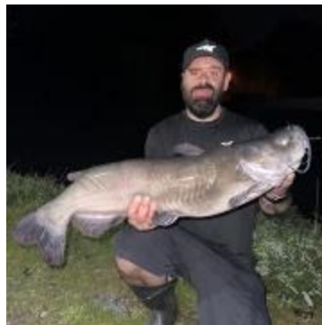
19.5 pound Channel Catfish