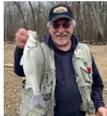
Hook; 6 lb Gamma Polyflex