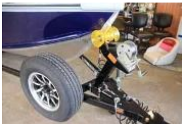
Foldaway tongue & winch

trieved on secondary ramps that may be somewhat shallow. And that 20 HP Yamaha will quickly put the boat on plane with two adults aboard.