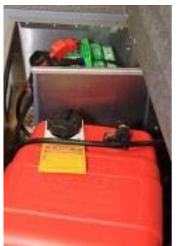
Battery & gas tank

I always preach that tiller steering is best in boats up to 17 feet with horsepower under 50 HP. Without a console, there is more room for anglers to move about to fish effectively. However, I know some people are hesitant to run a tiller (why I don't know), so a steering console can be installed. The V167 can be launched and re-