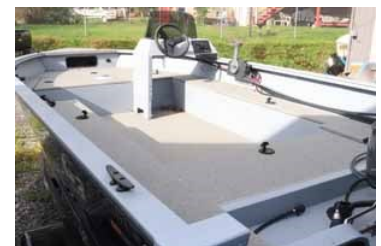
Console mode- roomy layout

Right now, Wiegel Brothers Marine in Franklin has two 2024 G3 V167 models with 20 HP Yamaha still in stock. These are their last two 2024 model year boats (one is a tiller and one has a steering console); both are discounted to sell. If you really want a do-