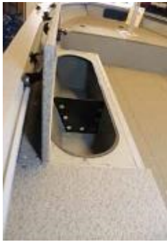
Livewell on left

The G3 Guide V167 has a roomy front casting deck which can comfortably accommodate a cabled bow trolling motor yet allow the angler to fish comfortably without being placed in an awkward position. You can pitch or flip for bass from the front. There is ample storage under the front deck, plus space for a battery. A live-well is located on the port side and a rod locker on the starboard side.