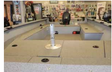
Large front deck

Over the last 53 years, Marilyn and I have owned 9 different fishing boats – 8 with outboards and one jet drive – all aluminum, all for serious fishing, all practical boats that get the job done economically. In that time, I've learned a thing or two about boat layout, storage, roominess, and pricing.