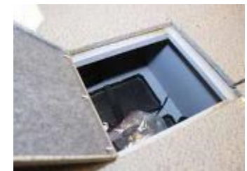
Bow battery compartment

In my opinion, the 2024 G3 Guide V167 is as good as it gets for an all-around craft built for a wide variety of fishing situations – from bobber fishing for crappies to pitching jigs for bass to trolling for muskies.